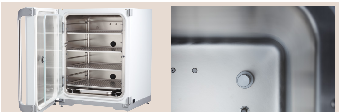
Figure 1: Eppendorf seamless easy-to-clean incubator chamber with rounded corners prevents contamination formation and allows quick cleaning procedures.

The Eppendorf solution: The deep-drawn chamber of Eppendorf CO 2 incubators is made from a single sheet of stainless steel, with no seams (Figure 1). The Eppendorf direct-heating technology results in natural and gentle convection circulation of the chamber atmosphere and does not require a fan or complex internal parts. There are no hidden corners to contaminate, and spills can be seen and wipe-disinfected. The racking and shelves can be removed in less than two minutes for quick cleaning and disinfection.