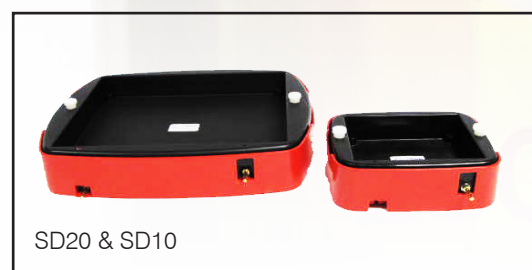
SD20 & SD10