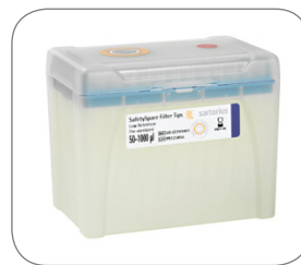
Single Tray racks purity-certified tip racks