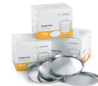
Disposable sample pans

* DAkkS = German accreditation body recognized throughout Europe