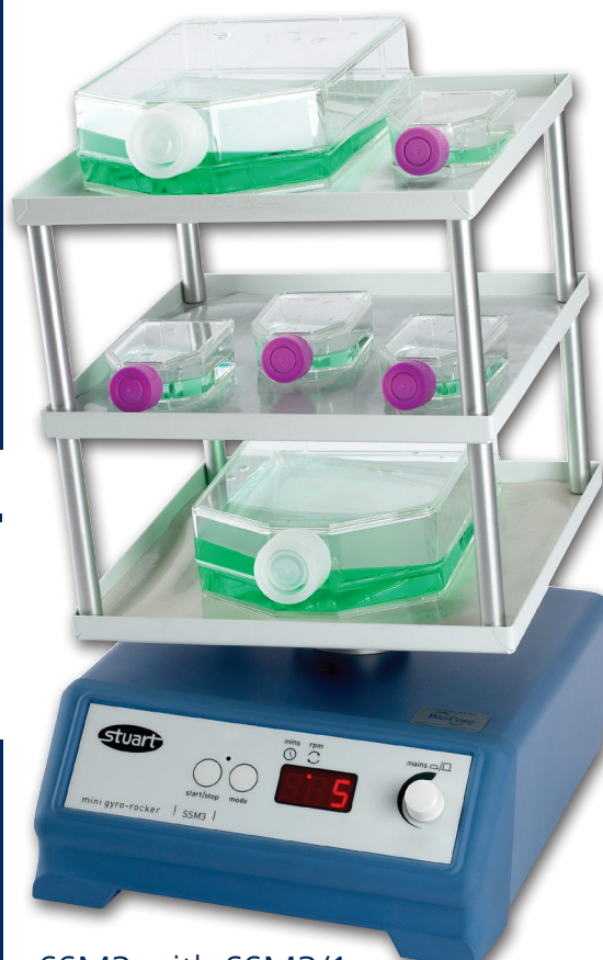
SSM3 with SSM3/1