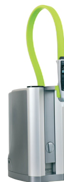
PURELAB flex 3&4