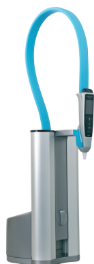
PURELAB flex 2