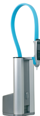
PURELAB flex 1