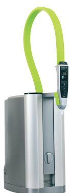
PURELAB flex 3&4