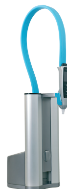
PURELAB flex 1