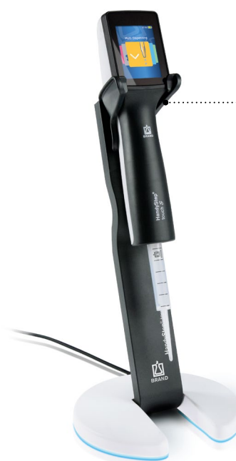
Charging stand with HandyStep® touch S and PD-Tip //