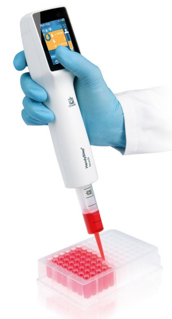
Multi dispensing with the HandyStep® touch and PD-Tip //

The HandyStep® touch saves time and prevents errors through automatic tip size recognition of the PD-Tips // from BRAND, with patented coding on the pistons. After inserting the tip, the size is automatically recognized and displayed, making it easy to select the volume to be dispensed. When a new PD-Tip of the same size is inserted, all instrument settings are maintained.