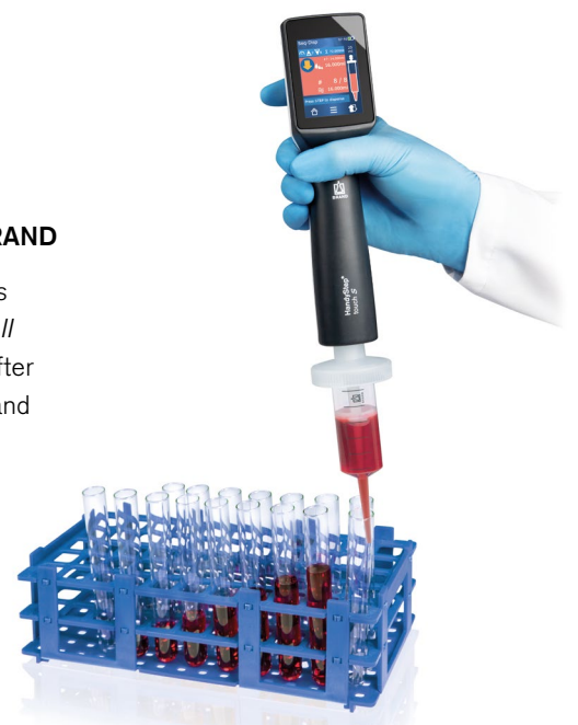
Sequential dispensing with the HandyStep® touch S and PD-Tip //