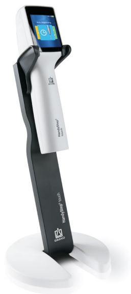
Support stand with HandyStep® touch