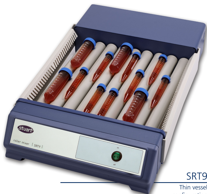
SRT9 Thin vessel configuration

The SRT stacking system consists of four magnetic stacking blocks that are designed to allow rollers to be stacked on top of one another, thus saving valuable bench space. Up to three rollers can be stacked in virtually any combination. Fitted in seconds, without any need for tools, the stacking blocks are easy to move into the optimum position where they hold the rollers securely in place by powerful magnets. They are equally as easy to dismantle if required for storage or cleaning purposes.