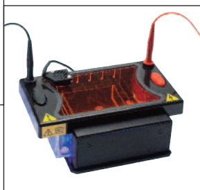
Blue light source features a sliding panel to accommodate both MINI and MIDI units