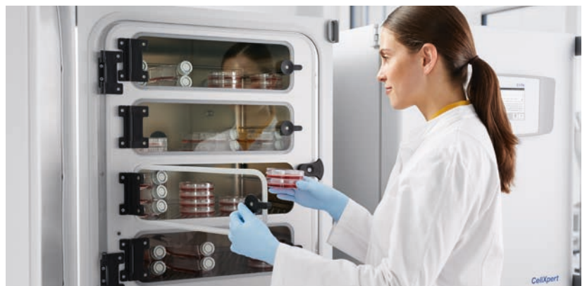
Available with small segmented inner doors to minimize hypoxia disturbance (CellXpert C170i shown here)