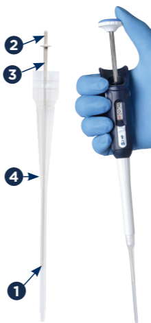
Figure 3 MICROMAN Capillary Piston