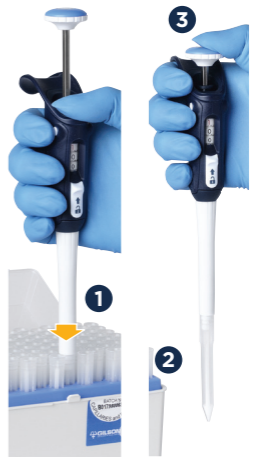
Figure 4 CP fitting on MICROMAN® E