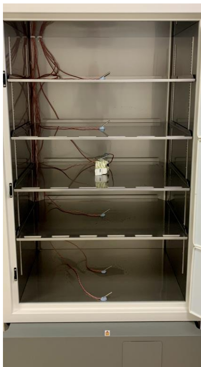
Figure 1. The F740hi with probes positioned at the centre of each shelf. Furthermore, additional probes were positioned at the back of the top compartment (compartment 1) and the front of the bottom compartment (compartment 5). Compartment 3, the middle compartment, had its probes positioned to be exactly at the middle point of the cabinet.

Ultra-Low Temperature (ULT) freezers are well known to be high consumers of energy. Holding set temperatures 90°C to 100°C colder than their environment will always require a significant amount of energy. One way to reduce ULT freezer energy consumption is to warm up the set temperature. By doing so energy consumption will be reduced from 18-34% depending on the model, age & condition of the freezer. When considering warming up their ULT freezers, some end users raise concerns that by taking such an action they may expose their samples/contents to unfavorable temperatures during their day to day operation.