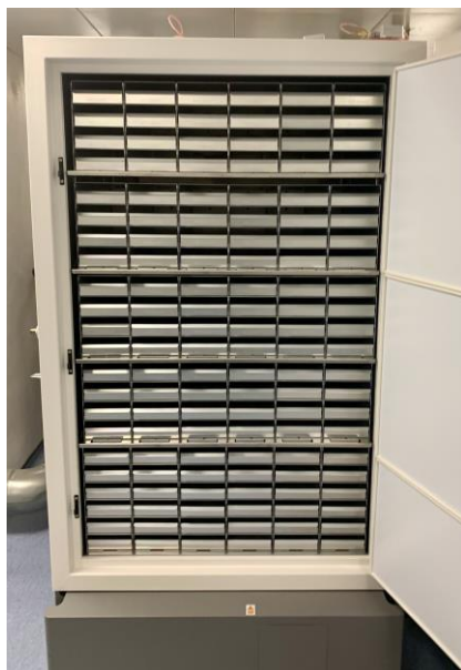
Figure 2. The F740hi filled with aluminium, front opening racking.